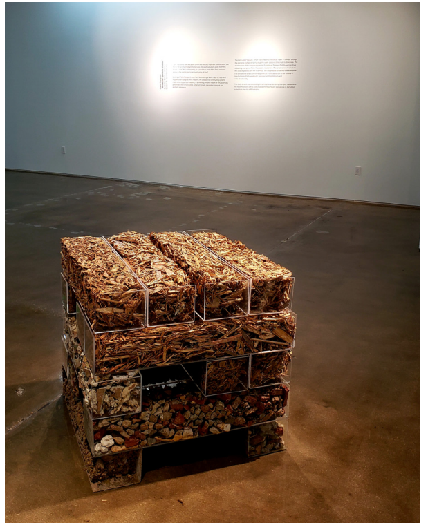
Casa mínima, 2019